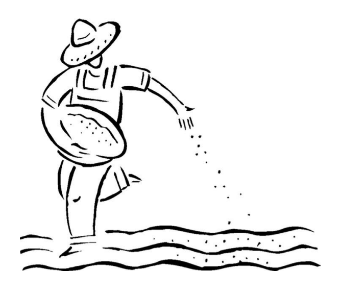
Fourth Sunday after Pentecost